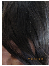
Figure 5: Numerous nits in a 15 year old girl with pediculosis