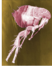
Figure 3: Scanning electron micrograph of a flea with false colours

Fleas are wingless haematophagous ectoparasites of birds and mammals, such as bats and humans [Figure 3]. Animal fleas bite humans coming in contact with infested animals. Flea bites produce maculopapular or papular rashes and severe pruritus (pulicosis). [69]. [70] Diagnosis is confirmed by examination of debris from pet's beddings [71] or presence of flea faeces, eczematous lesions or alopecia on pet's body. [1] Bites may produce psychological distress. [72] Treatment consists of eradication of flea infestation in the source animal.