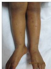
Figure 4: Lesions of papular urticaria in a 3 year old girl

Patients present with chronic or recurrent eruption of wheals and itchy papules [Figure 4] . A mnemonic SCRATCH aids in diagnosis (S, symmetric distribution; C, crops of different coloration with erythema and pigmentary changes; R, pet (rover) unnecessary for diagnosis; A, age 2 to 10 years; T, target lesions and time taking weeks to years to resolve; C, confused paediatrician or parent; and H, household with single family member affected). [76]