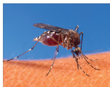
Figure 1: Aedes aegypti biting a human