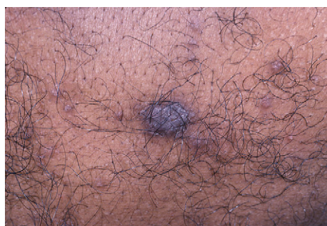
Fig 7. Verrucous sarcoidosis presenting as a hyperkeratotic papule. The lesions may be difficult to clinically distinguish from a wart.