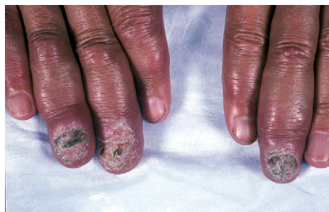
Fig 12. Changes in this case of sarcoidal dactylitis and nail dystrophy include brittleness, onycholysis, and subungual hyperkeratosis.