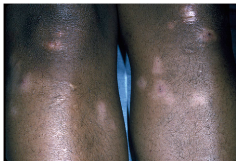
Fig 4. Well-demarcated leukodermic patches, typical of hypopigmented sarcoidosis. The differential diagnosis includes hypopigmented cutaneous T-cell lymphoma.