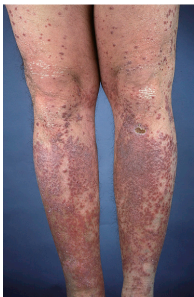
Fig 5. Psoriasiform sarcoidosis with hyperkeratotic plaques on the knees and lower extremities that resemble psoriasis. The appearance of eruptive papules on the thighs and legs is suggestive of guttate psoriasis, and can make the clinical diagnosis of sarcoidosis even more challenging.