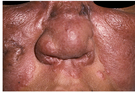
Fig 3. Advanced lupus pernio with bilateral, symmetric, indurated, sharply demarcated, brownish-red plaques confluent across the malar, submalar, and infraorbital areas and the nose. Some areas within the right cheek are nodular. There is a bulbous nasal deformity and involvement of both nares with extension into the nasal mucosa and partial destruction of the left nare.

Papular sarcoidosis is often present on the face, especially around the eyelids and nasolabial folds. 46 This type of eruption is associated with a favorable disease prognosis, and the lesions usually resolve