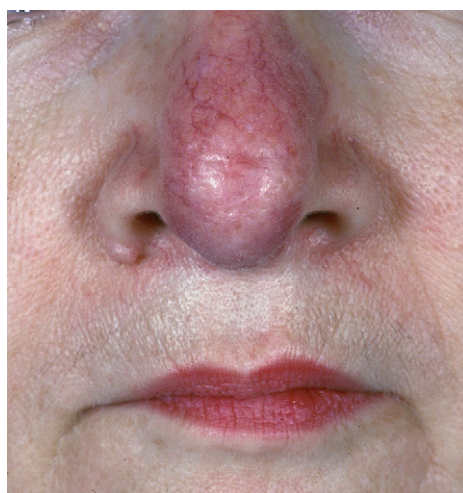
Fig 8. Angiolupoid sarcoidosis with multiple prominent telangiectasias within the lesion.

frequent intrathoracic (74%), upper respiratory tract (54%), ocular (37%), bone cysts (54%), and reticulo-endothelial (54%) involvement in patients with lupus pernio. 56 Lupus pernio is more common in women. Mutilating sarcoidosis appears to be a severe form of lupus pernio, with large centofacial tumors and extension into the oral and upper respiratory tissue that resemble Wegener granulomatosis and malignant pleomorphic lymphoma. 61