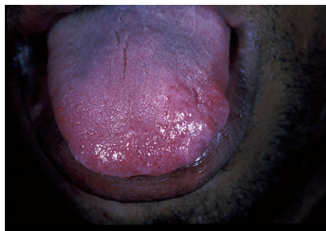
Fig 11. Oral sarcoidosis involving the tongue.

and anogenital area have been reported. Sarcoidosis of the nail can present as subungual hyperkeratosis, clubbing, pitting, trachyonychia, paronychia with nail fold fissuring, pterygium, onycholysis, dactylitis, longitudinal ridging, and discoloration of the nail bed (Fig 12). 81-83 Nail involvement is usually a marker of chronic disease. 83 Nail dystrophy from sarcoidosis is often accompanied by phalangeal bone disease, which is frequently associated with intrathoracic sarcoidosis. 84 Conversely, progressive polycystic osteitis with soft tissue involvement (Perthes–Jüngling disease) of the fingers and toes can produce nail dystrophy. A severe form with bulbous swelling of the fingertips, “drumstick dactylitis,” has been associated with lupus pernio.