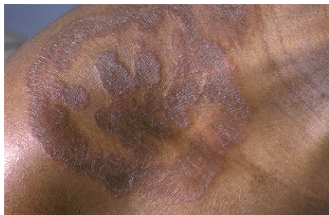
Fig 2. Annular sarcoidosis may be misdiagnosed as a dermatophyte infection, although scaling is not usually present in the former.

interactions between multiple genes may be involved 36 ; as previously implied, sarcoidosis may consist of several granulomatous diseases (“the sarcoidoses”), 36 each with its own putative exposure and genetic association.