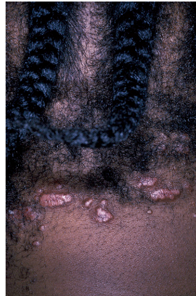
Fig 10. Papular sarcoidosis on the nape of the neck is difficult to distinguish from acne keloidalis nuchae and may represent a form of scar sarcoidosis.

erythrodermas (Fig 9). Notably, the histologic presence of epithelioid granulomas has been reported in some cases of Sézary syndrome with a more indolent than expected course. 71 Photodistributed sarcoidosis is recognized as a rare form of sunlight-induced papular sarcoidosis with negative phototesting that is distinct from polymorphous light eruption and lupus erythematosus. 72