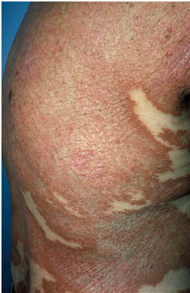
Fig 9. Erythrodermic sarcoidosis is a rare cause of erythroderma.