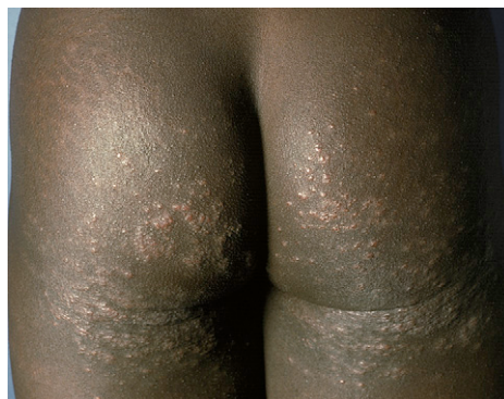
Fig 6. Lichenoid sarcoidosis, a variant of papular sarcoidosis, can mimic lichen planus or lichen planopilaris.